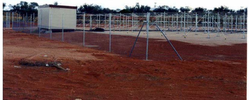
Typical Radar Installation

ATRAD wind profilers provide a highly cost-effective measuring solution with a very low total cost of ownership. Ongoing maintenance requirements are minimal, operation is unattended and there are no recurring consumable costs. Any number of radars may be remotely controlled from a central location. BUFR data output is provided to enable easy data assimilation into existing observation networks.